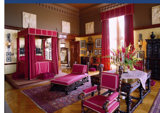
Grand Victorian architecture.