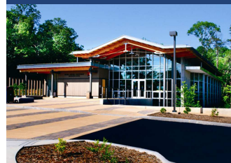
New Blue Ridge Parkway Visitor Center.