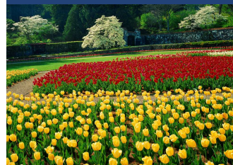
One of the Biltmore's many gardens.