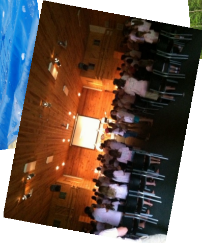
LIKE us on Facebook: Lake Tomahawk Christian Retreat Center