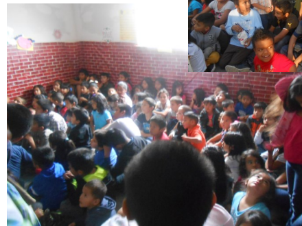
Children's Sunday School