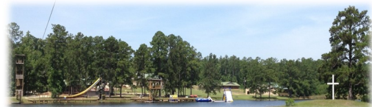
Lake Tomahawk Christian Retreat Center 408 Lake Tomahawk Rd, Livingston, TX 77351

I encourage each of you to attend the Fish Fry this April and check things out for yourself. I look forward to meeting and working with y'all for years to come!